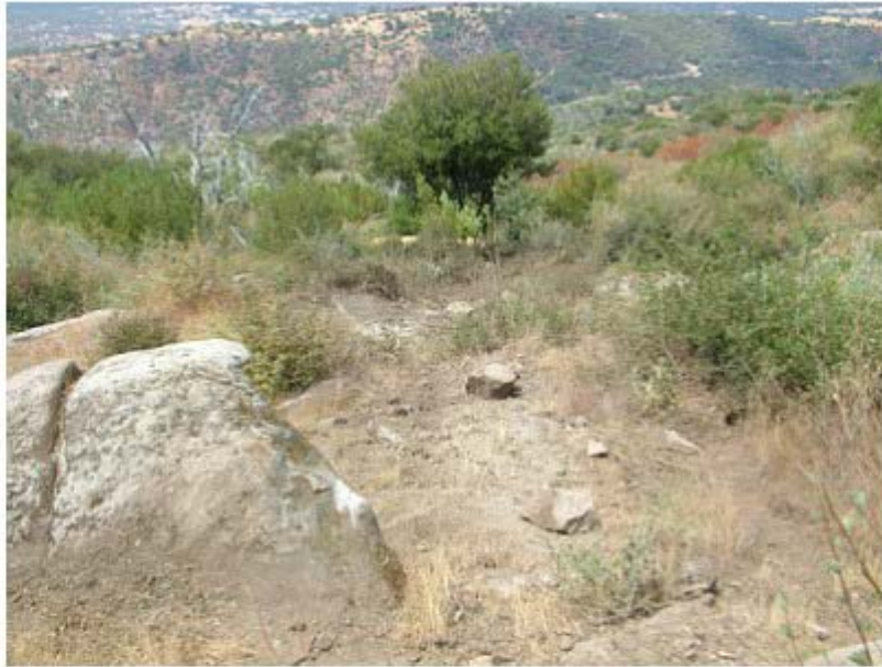
P-EW-001 View of slope looking down toward water tender