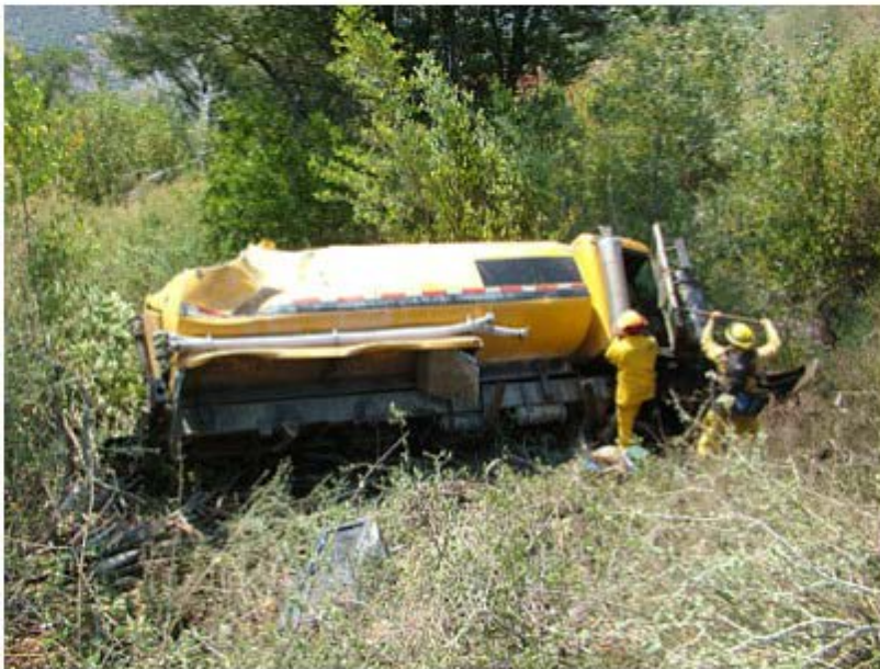
P-EW-002 View of water tender at rest