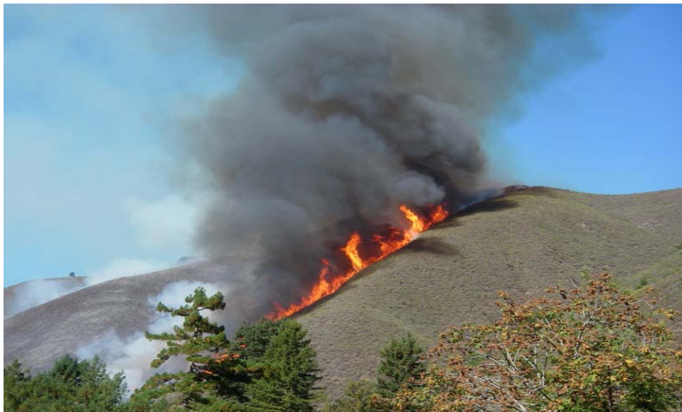
Colorado Fire Division S (Note upper portion of ridge with dozer line construction)

When D4641 and D4645 met on Division M, they proceeded down a spur ridge on Division S (the fire's right flank) constructing direct and parallel fire line. D4641 was in the lead.