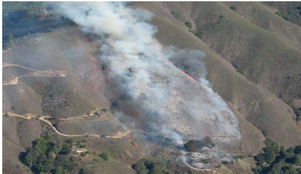
Colorado Fire

At 2:07 PM, Colorado Air Attack advised the IC the fire had grown to 30 acres.