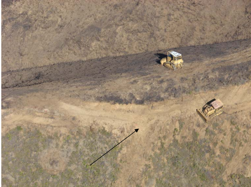
Point where soil became loose and Dozer 4641 started its decent.

D4641 rolled side-over-side 154 feet down a 83 percent to 94 percent slope into a drainage before coming to rest. During the plummet, the glass broke out from D4641's left side window. Towards the bottom of the drainage, D4641, while rolling mid-air, struck a large tree causing it to flip end-over-end. Either the sudden change in rotation caused by the impact or the centrifugal forces of the flipping and rolling pulled HFEO #1 from his seat (while still seat belted by a single lap-belt). The upper left rear of HFEO #1's unprotected head struck the metal mounting bracket of the heavy-mesh brush guard protecting the left side window and loose items in the cab of the dozer struck HFEO #1.