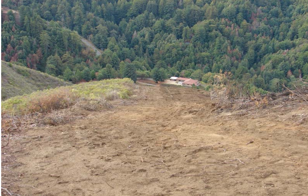
View of Division S at the top of the spur ridge

When D4641 and D4645 met on Division M, they proceeded down a spur ridge on Division S (the fire's right flank) constructing direct and parallel fire line. D4641 was in the lead.