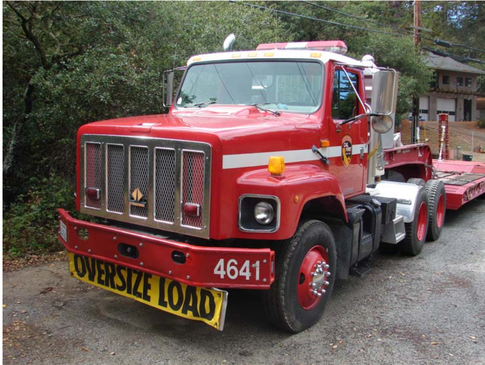
Parking location of T4641 at Mid Coast Fire Brigade Station

At 1:38 PM, the IC met with Division S and was displeased with the progress of the hose lay, which had proceeded about 30 feet. Division S expressed concerns about the spot-fires below the road on Division A and the steepness of the terrain on Division S. The IC assigned a CAL FIRE Helicopter to perform water drops on the spot fires in Division A and noticed a Helitack crew working the spot fires with ground tools.