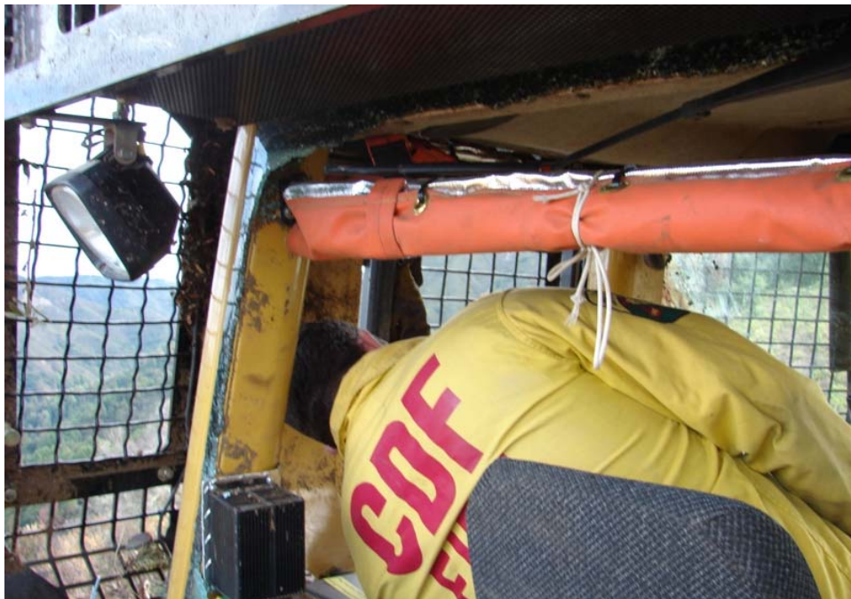
Simulated movement within cab of CAL FIRE D4641 during rollover