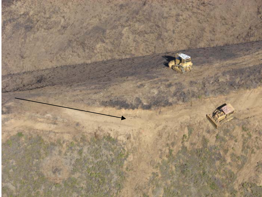
Aerial view of cut bench where D4641 was working towards D4645. Note The upper left dozer is D4643 used to anchor D4645 after the accident.

While waiting for the additional dozers to arrive, D4641 proceeded down the spur ridge approximately 100 feet below D4645 and turned around facing towards D4645. D4641 began constructing the bench to solid ground by pushing slough material, some of which went over the side slope.