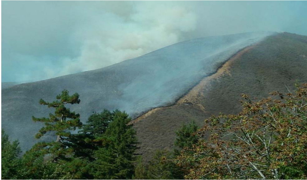
CAL FIRE D4645 stuck on Division S (center of picture) prior to D4641 Rollover