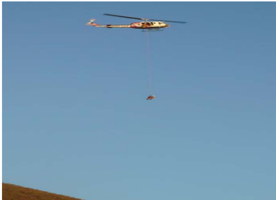
CAL FIRE Copter 106 during Short Haul Rescue

Copter 106 performed the short haul rescue and transferred HFEO#1 to Air Ambulance CalStar 7, which transported HFEO #1 to San Jose Regional Medical Center, arriving at 7:10PM.