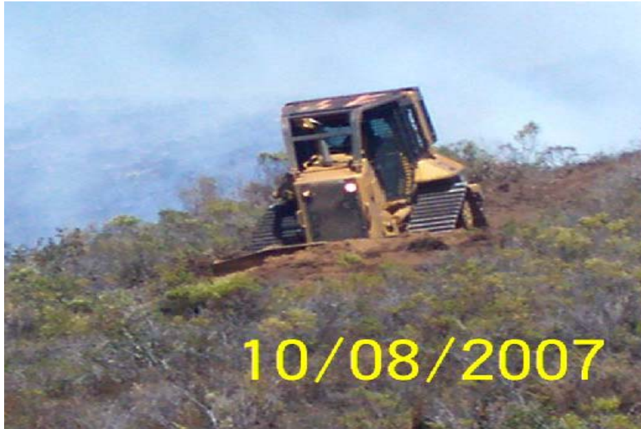
CAL FIRE D4641 during descent on Division S (Note large berm of soil in front of blade)

D4641 was on his way back to Division S when he met face to face with Division M on Ray Ridge Road. HFEO #1 stated "I'm not going back there, I have no reason to go back down that cliff again, that wasn't comfortable." HFEO #1 then said, "I gotta go get (D4645) out." They discussed the hazards of safely pulling D4645 back onto the crest of the ridge. Division M stated, "...You know what you are up against, you know it's steep and dangerous. Just watch yourself. Be safe and don't do anything stupid. If you guys have to watch that dozer roll down the bottom of the cliff I am fine with that as long as you and (D4645) are standing on the ground."