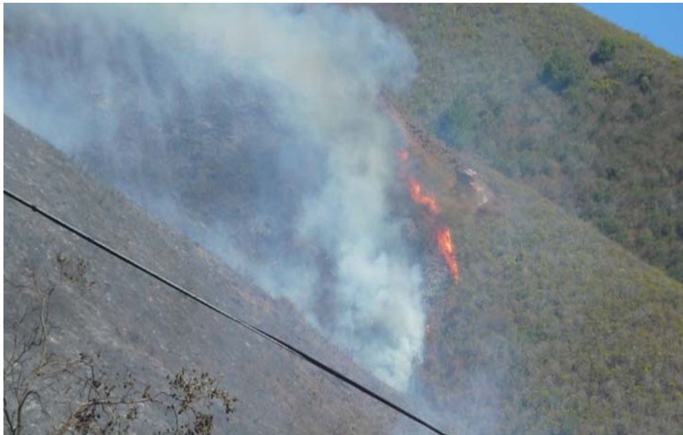
CAL FIRE D4641 constructing line on Division S

During line construction on Division S, D4641 created a berm (or windrow) of cut material. D4645 had to move the berm because the material was building up on the downhill side of his blade, pulling him into the drainage. D4645 communicated his difficulty to D4641 and requested that D4641 straighten his blade to reduce the berm/windrow. D4641 straightened his blade and continued down the slope. D4645 lost sight of D4641 due to the topography.