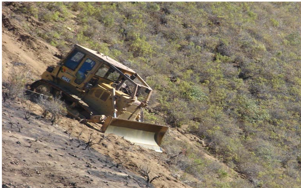
CAL FIRE D4645 stuck on Division S

D4641 attempted to back up; however, his tracks began to dig into the loose soil and realized he was committed to continue down slope before he could return to D4645's location. HFEO #1 advised D4645 that D4641 would need to go all the way down Division S and back around to the top of the ridge (via Ray Ridge Road). D4641 realized he could not see the terrain below him and stopped. D4641 then requested assistance from ground resources on Division S to help guide him by radio, the last 600 feet of the 94 percent plus spur ridge. (see Attachment 6.C.5 Detailed Area of Accident Site)