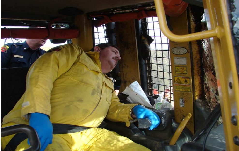
Simulated movement within cab of CAL FIRE D4641 during rollover (Note single lap belt)