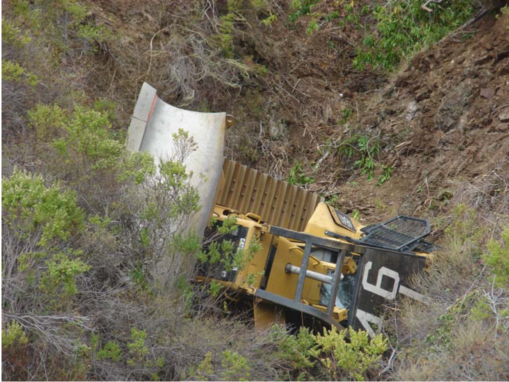
CAL FIRE D4641

Helitack personnel from CAL FIRE Copter 106 and CAL FIRE Copter 406, who were working on the ground on Division M, overheard the radio traffic, and quickly responded to D4641's location and provided extrication and immediate medical assistance to HFEO #1.