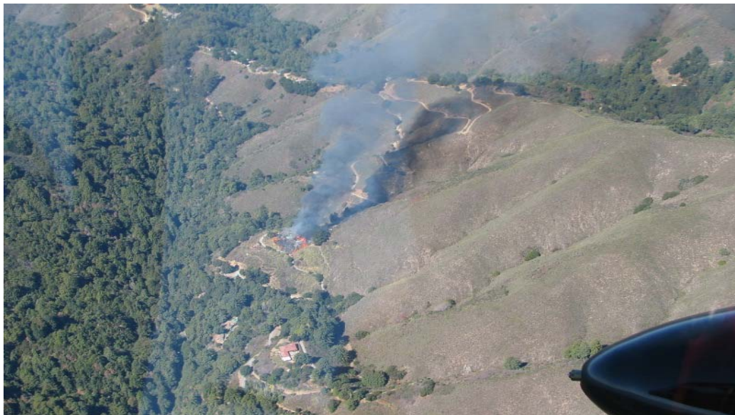
Colorado Fire from CAL FIRE AA 460

CAL FIRE Air Attack 460 reported the fire was on the western aspect of a steep slope and was approximately four acres with potential growth to 50 acres. He requested two additional air tankers and one additional helicopter.