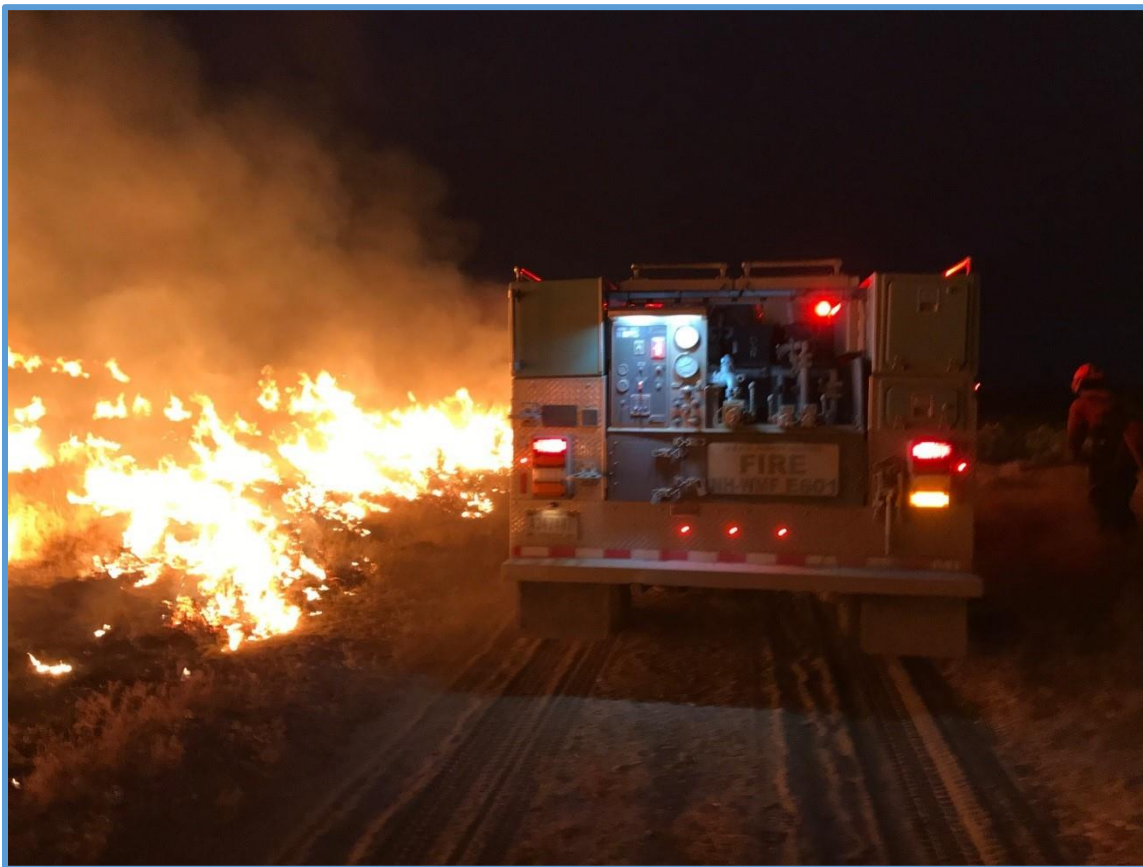
Fire behavior beside Engine E601 during the burn out operation.

The west road was a relatively flat, somewhat maintained two track. The fuels were very thick sagebrush patches, especially where the prep was not complete . . .