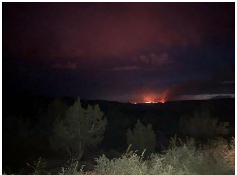
The Basin Fire burning on May 10 in Pakoon Basin of the BLM's Arizona Strip District.