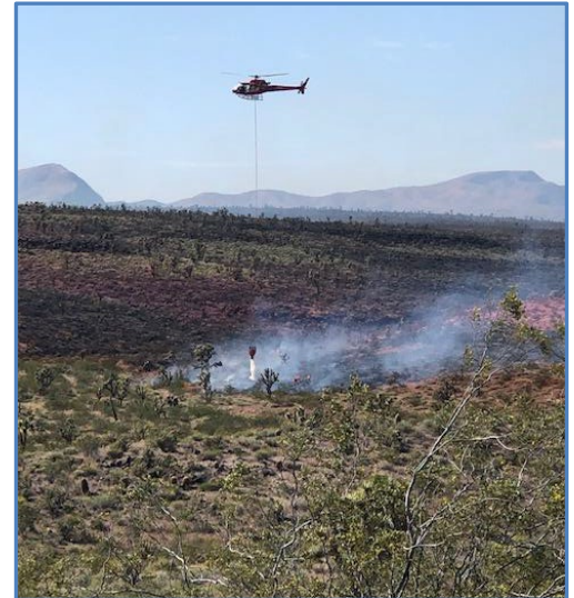
Aviation resources on the Basin Fire.

The IC Trainee stated that if he had it to do over again, he would have made face coverings mandatory at briefings. He strongly recommended procuring a microphone and speaker system for in-person briefings so everyone can hear.