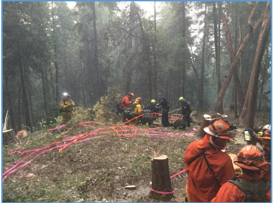
REMS providing ALS treatment for a heat-related injury on the Miller Complex just before the patient was hoisted from the fire line.

One REMS member said: “If we would have gotten a call, we could have dumped the equipment right there and took off.” Again, there must be a balance between being active and being ready to act when the call comes in.