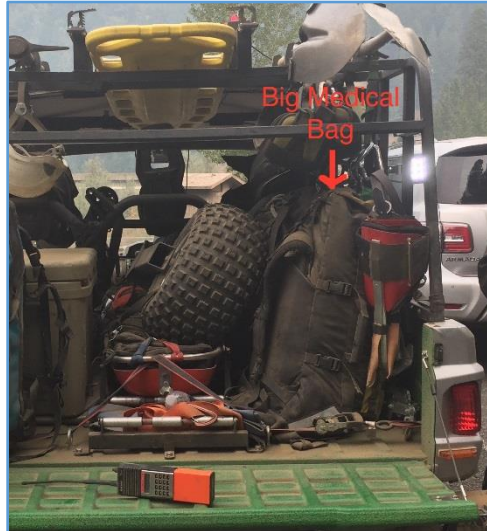
Example of modulated gear. On the left, a small medical bag that weighs 12 pounds. On the right, a much larger medical bag, that weighs 35 pounds.

They also have a much larger medical bag that they can send someone to the UTV to bring up, or they can simply start it up the hill at the same time the person with the lighter bag starts, with the intention that it will arrive shortly after the first smaller bag arrives.