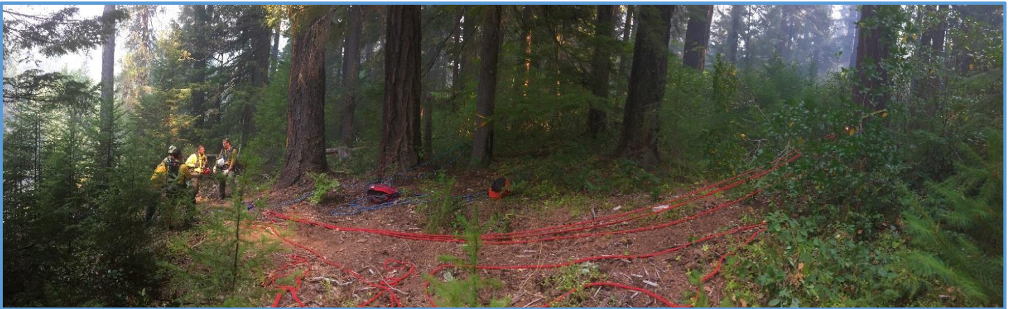
The REMS team conducts an AAR where a rope system was used during a training exercise on the Umpqua North Complex.

Director of Wildland Operations, Advanced Life Support – Rapid Extraction Module (ALS REM) Phoenix, Arizona