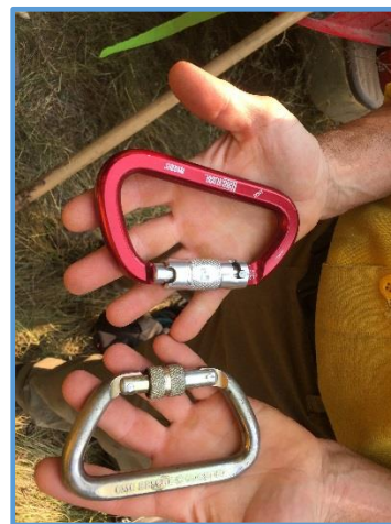
Aluminum carabiner (top) compared to stainless steel carabiner (bottom). One REMS member interviewed said they'd like to switch to aluminum because they are lighter in weight.

One REMS with a qualified sawyer traveled with a chainsaw, which makes a lot of sense, but also takes up a lot of space. One REMS mentioned that they try to strike the equipment weight balance by having modular gear bags. They have a small medical bag with one IV bag and enough medical supplies to initiate patient care.