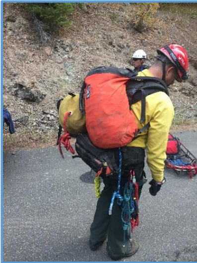
REMS Rope Technician with two rope bags that meet Low angle Rope Rescue Operations (LARRO) standards.