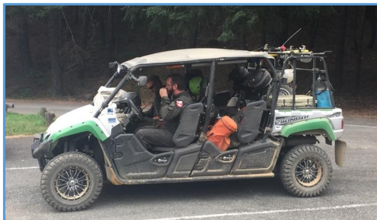
This UTV is equipped with rappelling gear, Advanced Life Support equipment including a mobile EKG, a wheeled Stokes, wildland hand tools, and a rigid backboard. In addition to this equipment, the Paramedic, EMT, and Army Combat Medic on this resource consider themselves "an alternative to a short-haul helicopter operation."

No matter how REMS is configured, they all will need assistance from other resources on the fire to be successful in their extraction operations. Some will require being married-up with Paramedics, some will require transport, most will require air or ground ambulance support. However, all REMS will require additional people to be ready to retrieve equipment, assist in transporting the wheeled Stokes, assist with set-up and use of rope systems, etc.—in other words, "throwing calories at the problem."