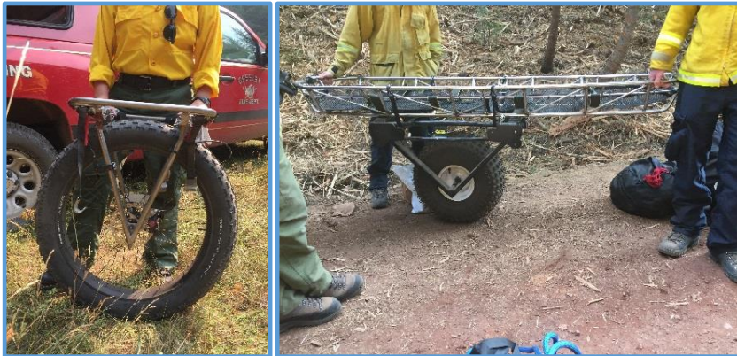
Wheel systems for transporting a Stokes basket. "Skinny Wheel" on the left. Wide wheel on the right, also known as "The Big Wheelie."