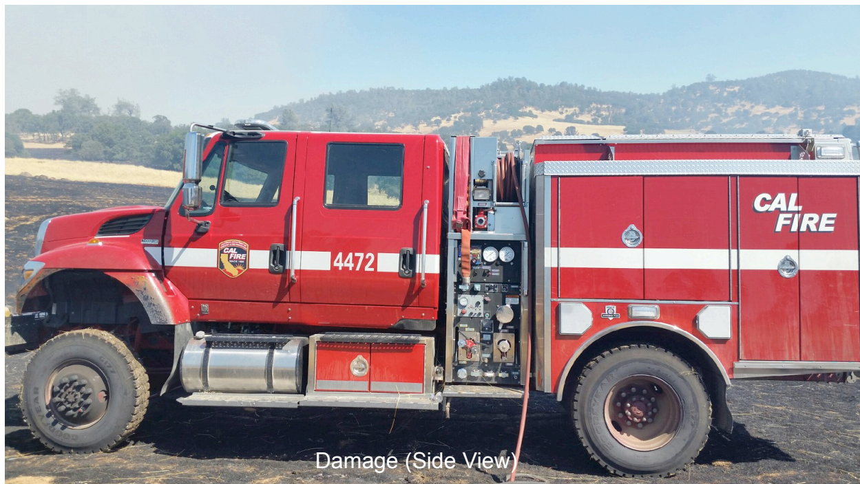
Damage (Side View)